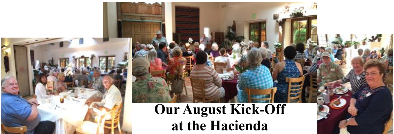
Our August Kick-Off at the Hacienda